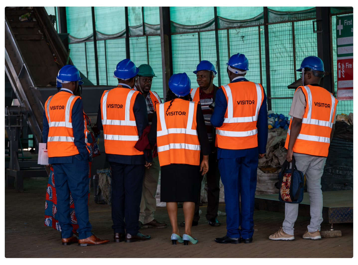
Site visit to Mr. Green Africa

The workshop attendees visited Mr. Green Africa in Nairobi to learn about the company's plastic recycling process. During the site visit, the legislators asked and were informed about various aspects of the business, such as the machinery used, profitability, and process of washing and shredding the collected plastic waste. The company handles three types of plastics, namely PET, HDPE and PP and works directly with informal waste pickers, with collection and sorting centres across the country and a main processing plant in Nairobi. The legislators also inquired about the