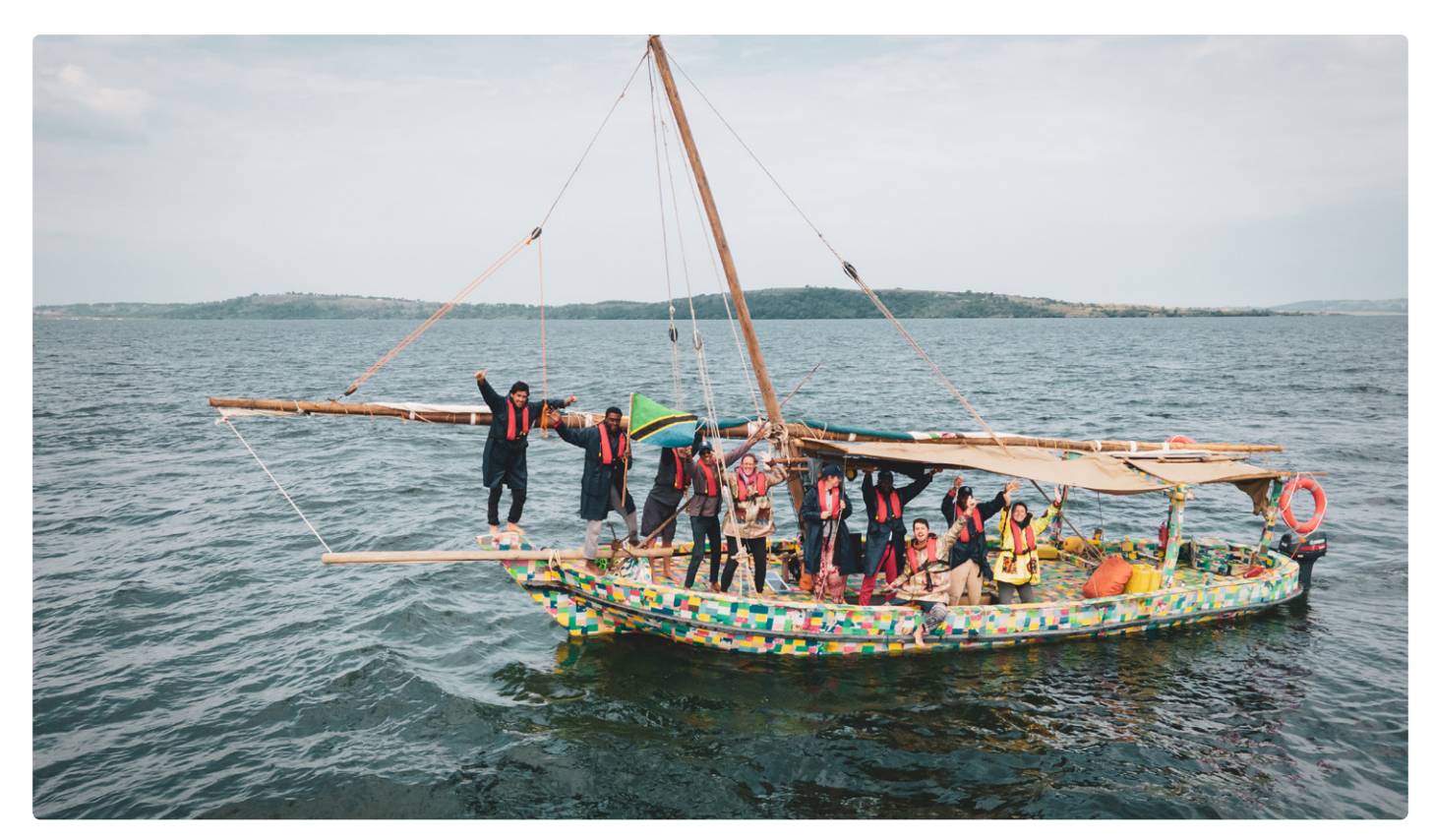
The Flipflopi Dhow on its Lake Victoria expedition, 2021

provoked a number of concerns from the legislators related to the plastic products created by the Flipflopi team. These concerns include safety of the boats, durability, cost, disposal at the end of their useful life. and their environmental impact on aquatic life as they break down into microplastics and leach chemicals. Fortunately, many of these issues can and should be addressed at the manufacturing level, and education and environmental safety are key factors that need to be considered. Davina stated that by implementing measures to reduce the environmental impact of plastic products, we can ensure that we preserve our planet for future generations.