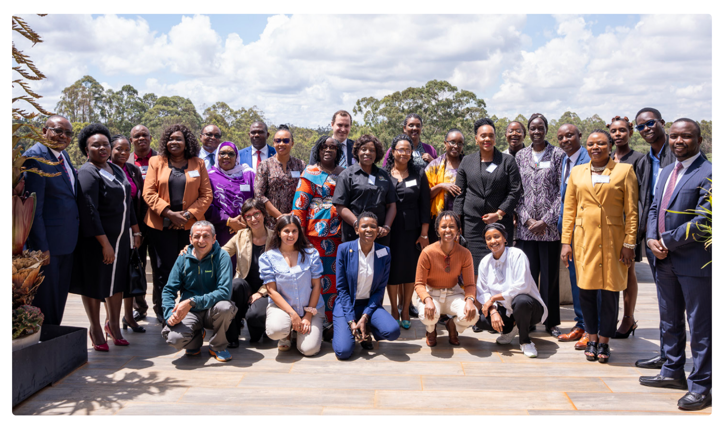
Legislators and facilitators who attended the workshop at ALN House.

armonised regional legislation was identified as a crucial step towards addressing the issue, as it ensures consistent enforcement across borders, facilitates a circular economy, and enhances the voices of African countries in the ongoing negotiations towards a global binding instrument against plastic pollution under discussion at the UN. The workshop emphasised the importance of collaboration among stakeholders and the need for capacity building to enhance awareness and understanding of plastic pollution issues and their social consequences.