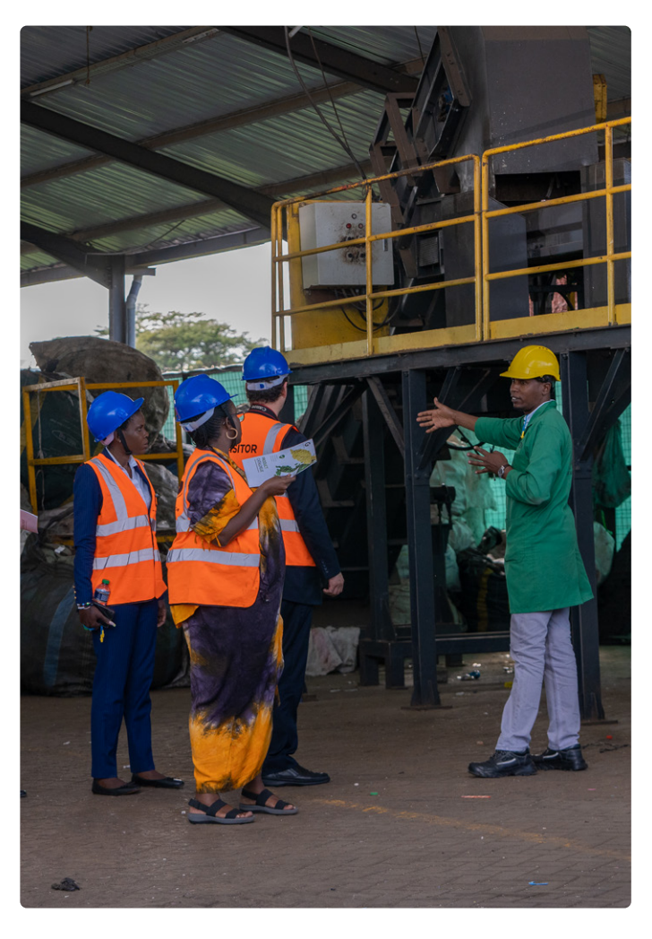
Mr. Green Africa staff explaining the process to workshop attendees

legislators recognized However, the that Gjenge Makers have made significant strides in their recycling efforts, and they are creating a positive impact in the community. The team also appreciated the unique products that Gjenge Makers is creating from plastic waste and recognized their potential to become a major player in the industry, especially as product lines develop. While there is certainly room for improvement in terms of worker safety and plant ventilation, the team recognized the efforts of Gjenge Makers and encouraged them to continue pushing forward to establish partnerships in their mission to create sustainable solutions for plastic waste, especially with government support for their innovation.