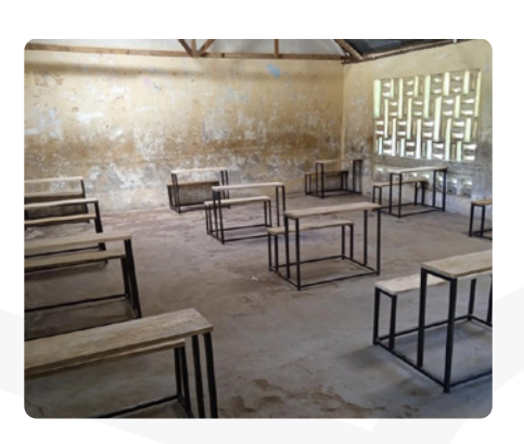
Donation of desks